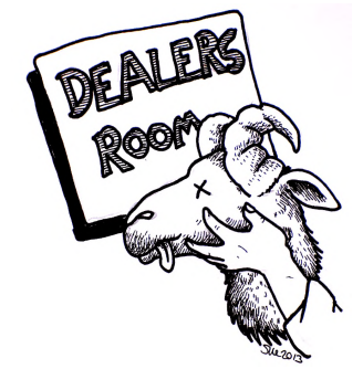
No, Sue, the dealers are accepting groats...

The Dealers' Room would like you to know that Groats are acceptable currency for all debts, public and private.